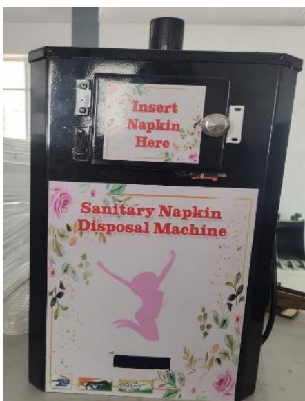
Fig.3 Front view