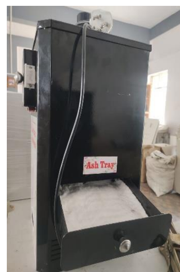
Fig.4 Side view