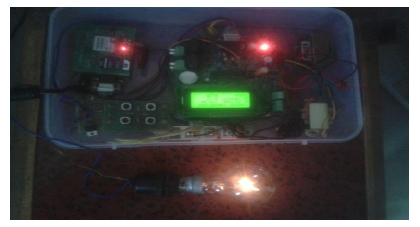
5.2 Image2-30% dimming of light brightness(Power saving mode 1)

This image of lamp shows first Power saving mode. In that case light intensity of lamp shown in Image 2. In power saving mode1 condition it consume 0.23A current and voltage is 244.97V Hence it consume 56.34watt. In comparison with normal it save 7.1watt per day and 2595.15 per year.