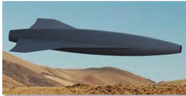
Figure.1: The Go-Jet supersonic UAV is promised to go faster, using less fuel, than other aircraft in its weight class.

kg. The engines used in these aircrafts are small in size and generate more than twice the power than other engines of similar size.