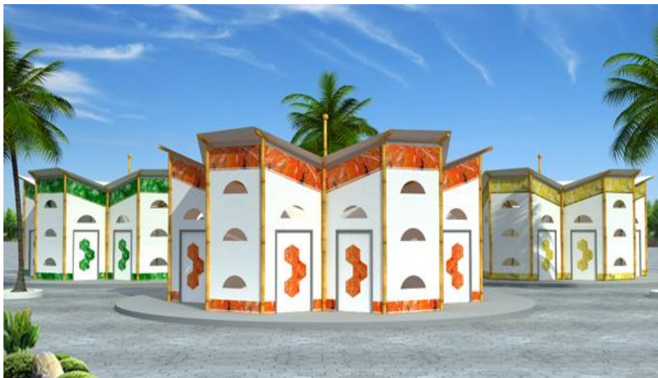
Fig. No. 1

Keywords : Affordable, Modular, Sustainable, Semi-Permanent Quality Housing