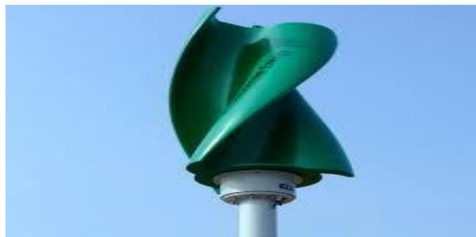
Fig. Wind Mill Turbine

A wind mill is machine for wind energy transformation. A wind turbine converts the kinetic energy of the wind's motion to mechanical energy transferred by the shaft. A generator further converts it to electrical energy. So it is compulsory to keep in mind, while designing the windmill's structural part.