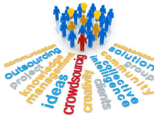
Fig.1: Idea of CrowdSourcing.

The best example of CrowdSourcing is Wikipedia. The text available on Wikipedia is a collaborative work, and the practices and efforts of all individual workers contribute to a page. This page after proper validation becomes publically viewable for the users.