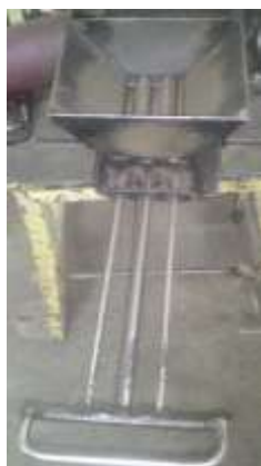
Fig 5.4.5 Feeder Mechanism