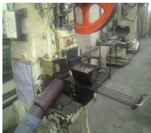
Fig 5.4.7 Assembly of New Die, Punch, Feeder and Ejector mechanism