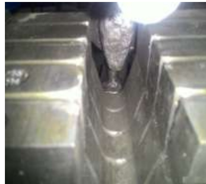
Fig 5.4.4 New Die and Punch