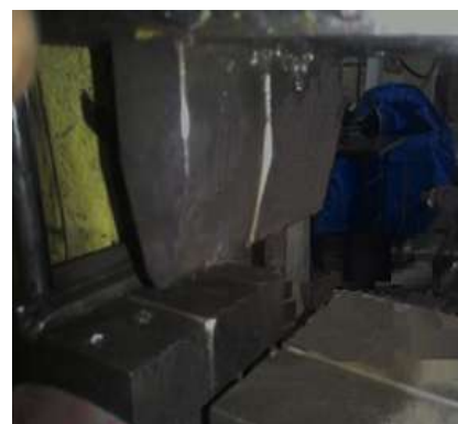
5.4.2 Actual existing Die and Punch