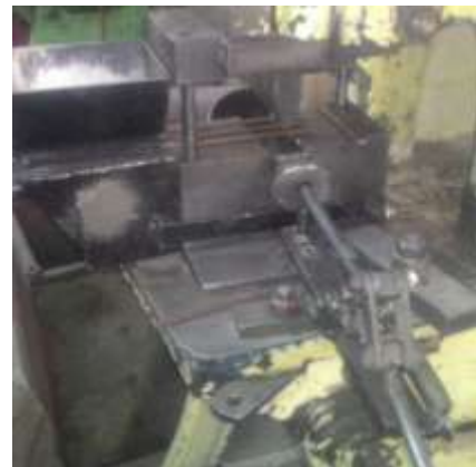
Fig 5.4.6 Ejector Mechanism