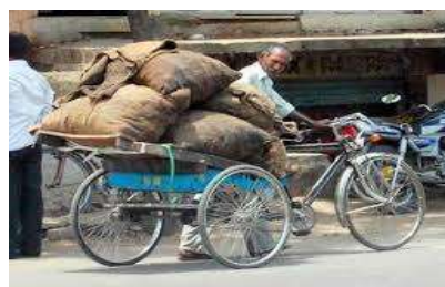
Fig. 1 Problem faced by Rickshaw puller