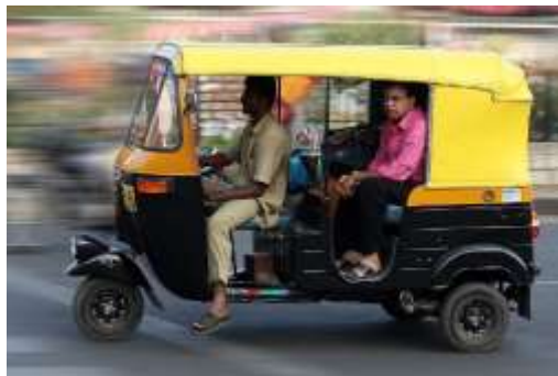
Figure 5.e. Auto Rickshaw

Auto rickshaws are used in cities and towns for short distances; they are less suited to long distances because they are slow and the carriages are open to air pollution. Auto rickshaws (often called "autos") provide cheap and efficient transportation. Modern auto rickshaws run on