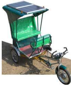
Figure 5.c. Solar Rickshaw