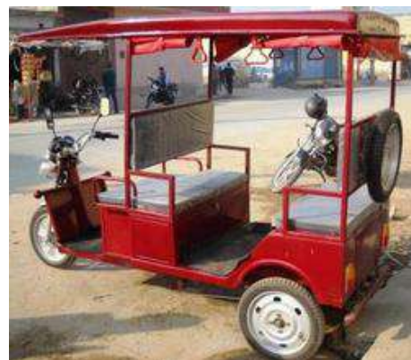
Figure 5.b. Battery E-Rickshaw