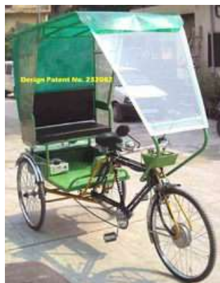
Figure 5.a. Battery Operated Covered Rickshaw

Unique design with normal frame, forks, wiser, covered rooftop. Also available with Stainless Steel Frame and fork. Capable to carry 2-4 passengers with ease. Heavy Duty Motor, Batteries and standard material. Warranty covers for longer period.