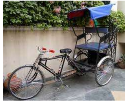
5.d Cycle Rickshaw