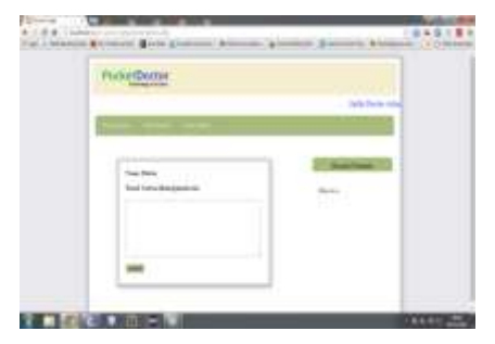
Fig 2: Sending Prescription to the patient.

4) User can fix appointments with the hospitals, clinics, physicians registered on the application.