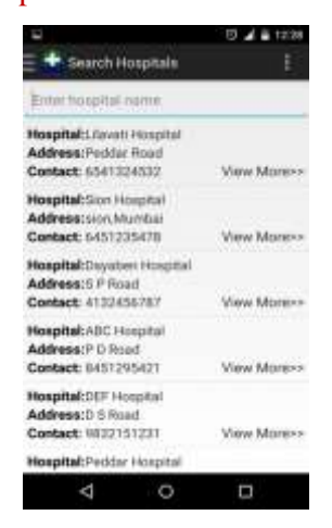
Fig 4: Hospital Search Functionality