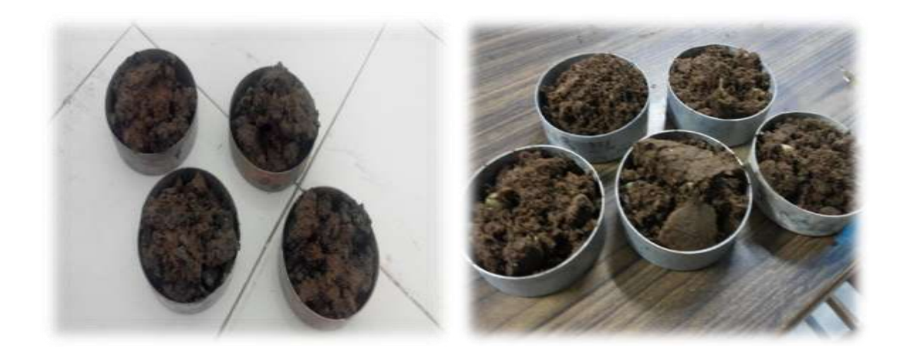
Plate I- WTP Sludge

Table II shows the mean physical characteristics of WS5 and TW5 bricks. The mean weight of brick samples ranged from 2743 grams to 2945 grams with the TW5 brick being the lightest.