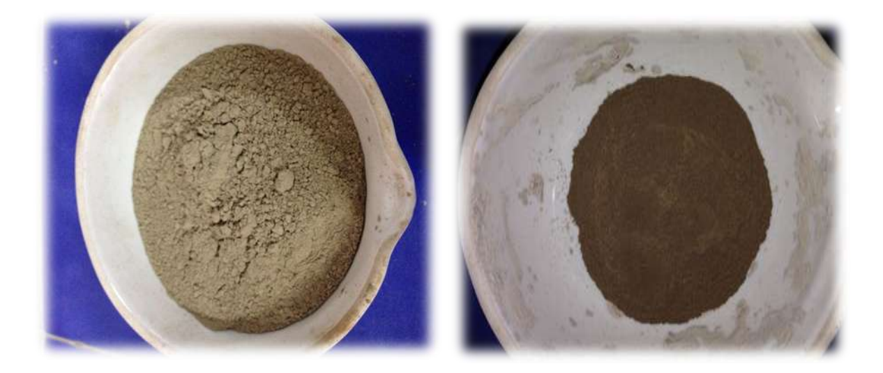
Plate III- Crushed WTP Sludge