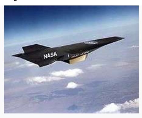
Fig.1 NASA X-43with scramjet attached to the underside

The first successful flight test of a Scramjet was performed by Russia in 1991. It was an axisymmetric hydrogen-fuelled dual-mode scramjet developed by Central Institute of Aviation Motors (CIAM), Moscow in the late 1970s. The scramjet flight was flown captive-carry atop the SA-5 surface-to-air missile that included an experiment flight support unit known as the "Hypersonic Flying Laboratory" (HFL), "Kholod".[2] Then from 1992 to 1998 an additional 6 flight tests of the axisymmetric high-speed scramjet-demonstrator were conducted by CIAM together with France and then with NASA, USA.[3] Maximum flight velocity greater than Mach 6.4 was achieved and Scramjet operation during 77 seconds was demonstrated. These flight test series also provided insight into autonomous hypersonic flight controls.