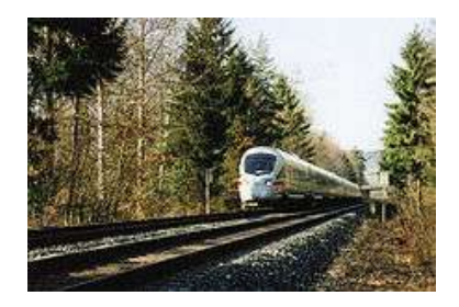
Fig.2 An ICE TD in regular service in 2002