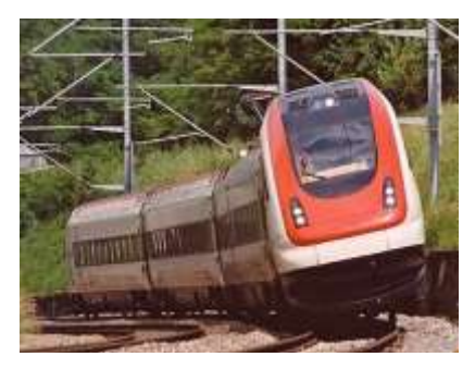
Fig. 1 tilting train

A train and its passengers are subjected to lateral forces when the train passes horizontal curves. Car body roll inwards, however, reduces the lateral acceleration felt by the passengers, allowing the train to negotiate curves at higher speed with maintained ride comfort [1]. Trains capable of tilting the car bodies inwards in curves are called tilting trains . Tilting trains can be divided in two groups: the naturally tilted trains and the actively tilted trains Natural tilt relies on physical laws with a tilt center located well above the Center of gravity of the car body. In a curve, under the influence of lateral acceleration, the lower part of the car body then swings outwards. Active tilt may have car body center of gravity and rotation center at about the same height. This form of tilt does not normally have an impact on the safety of the train, since the center of gravity does not essentially change its (lateral) position. Active tilt relies upon control technology involving sensors and electronics and is executed by an actuator, usually hydraulic or electric, without actuation there is no significant tilt action.