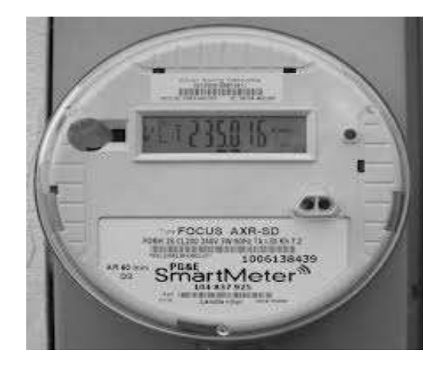
Fig.2 Smart meter

A smart meter consists two units. One unit of the metering device is in the custody of the distribution or utility company and the other is the display unit which is at consumer's place. A smart meter has designed with builtin-technology to disconnect and reconnect certain loads remotely. Smart meters are implemented to monitor as well as to control end users and appliances to manage demand and load flow in the future. Smart meter's data comprises the unique meter identifier, data timestamp, the electricity utilized values and so on.