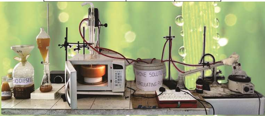
Fig.4: Experimental Process for bio diesel production from waste cooking oil.